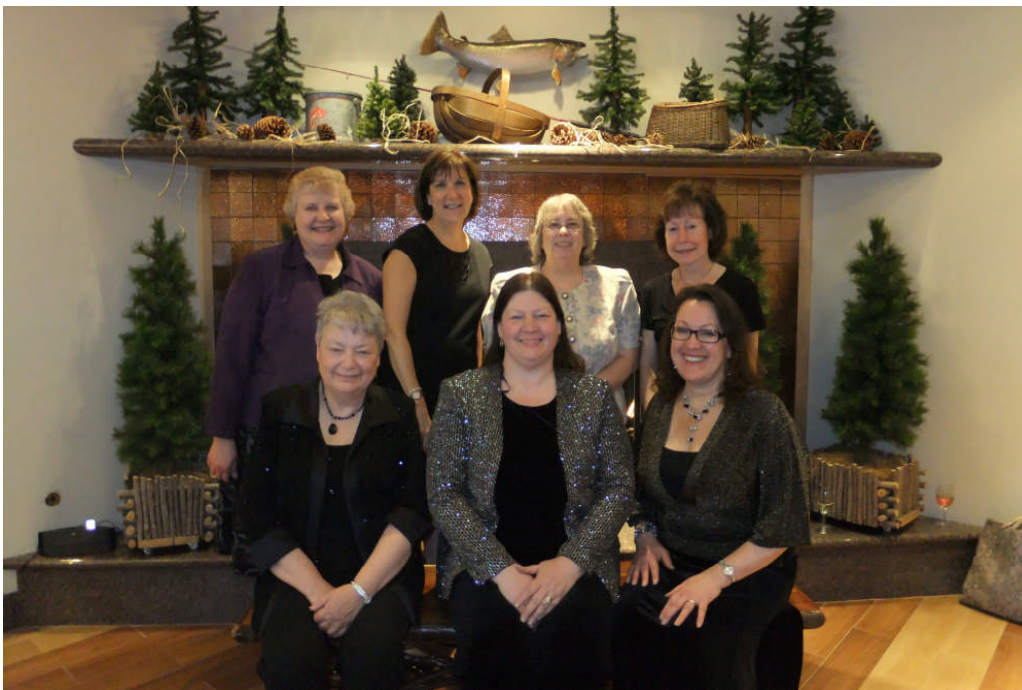
Left: Our chapter's "official photo" taken at the NALS of Michigan 2011 Annual Meeting at Crystal Mountain Resort.